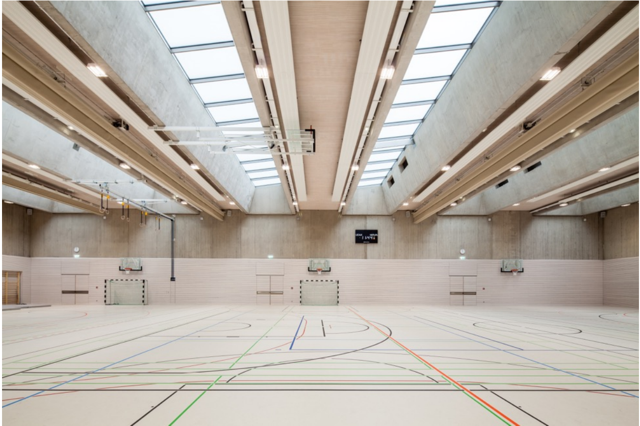
Okalux_LESC-Clervaux_© Camille Dengler_01

Plenty of daylight despite strong sun protection: OKASOLAR 3D in the triple-sized sports hall at the LESC.