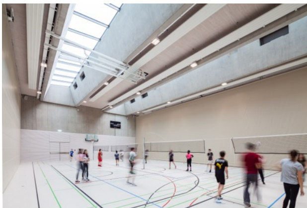
Okalux_LESC-Clervaux_© Camille Dengler_02

Plenty of daylight despite strong sun protection: OKASOLAR 3D in the triple-sized sports hall at the LESC.